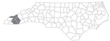
THE SCC SERVICE AREA, NC

The Health Science Professions program 1 was established in 1967. In FY 2019-20, SCC enrolled 628 students in the program. Of these students, 28 graduated with a certificate and 123 graduated with an associate degree in FY 2019-20.