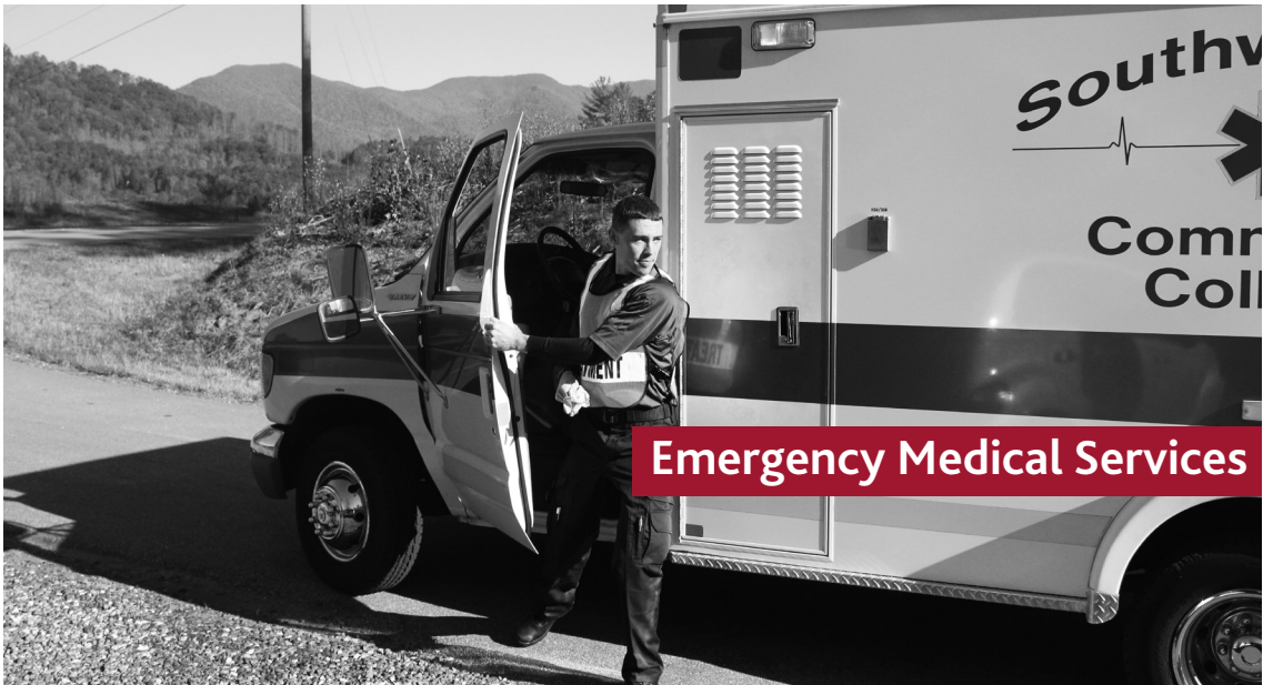
Emergency Medical Services