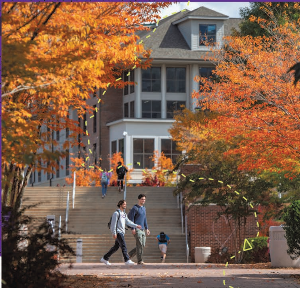
CHART YOUR NEXT COURSE.