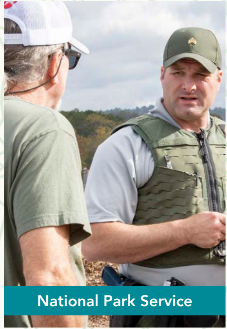
National Park Service