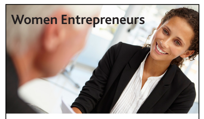
Lunch and Learn with The Support Center's Women Business Center

How to Find Your Customers: Theory is great...but hands-on work actually gets a business started. At this 3-hour workshop, you will spend quality time with a marketing consultant and a market research expert to begin a draft of your customized marketing plan. You will hone your core marketing message, explore marketplace visibility for your business, uncover competitors, describe your target market and develop marketing strategies. After this workshop, you will be well on your way to complet-