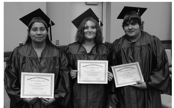
Swain County graduates