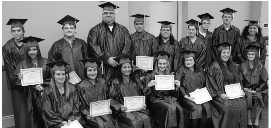
Macon County graduates