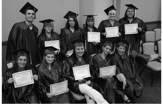
Jackson County residents who received their GED® diplomas during the Jan. 16 ceremony at SCC's Jackson campus.