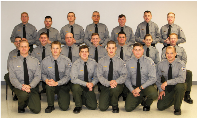
Graduates of SCC's NPS-SLET Class 95

For more information about programs offered through the SCC-PSTC, visit www.southwesterncc.edu/pstc or call 828.306.7041.