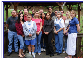
Fall Semester Tutors

Tutoring is available in all subject areas on the Sylva and Macon campuses.