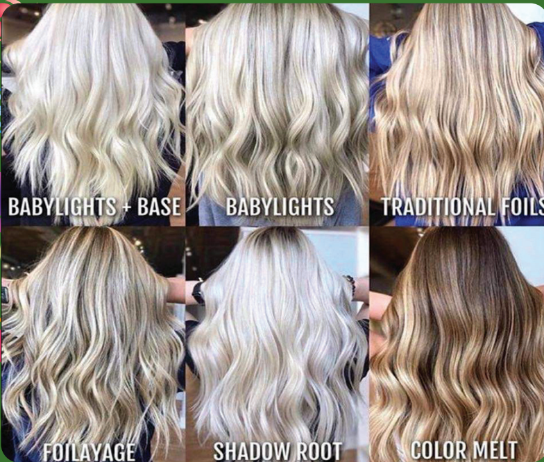
BABYLIGHTS + BASE