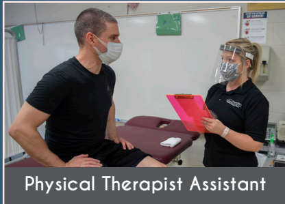
Physical Therapist Assistant