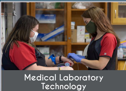
Medical Laboratory Technology