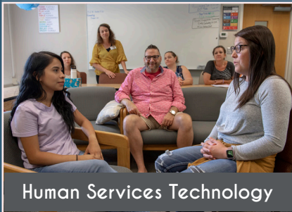
Human Services Technology