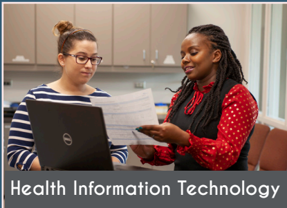
Health Information Technology