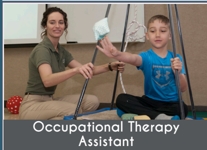
Occupational Therapy Assistant