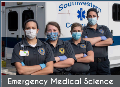
Emergency Medical Science