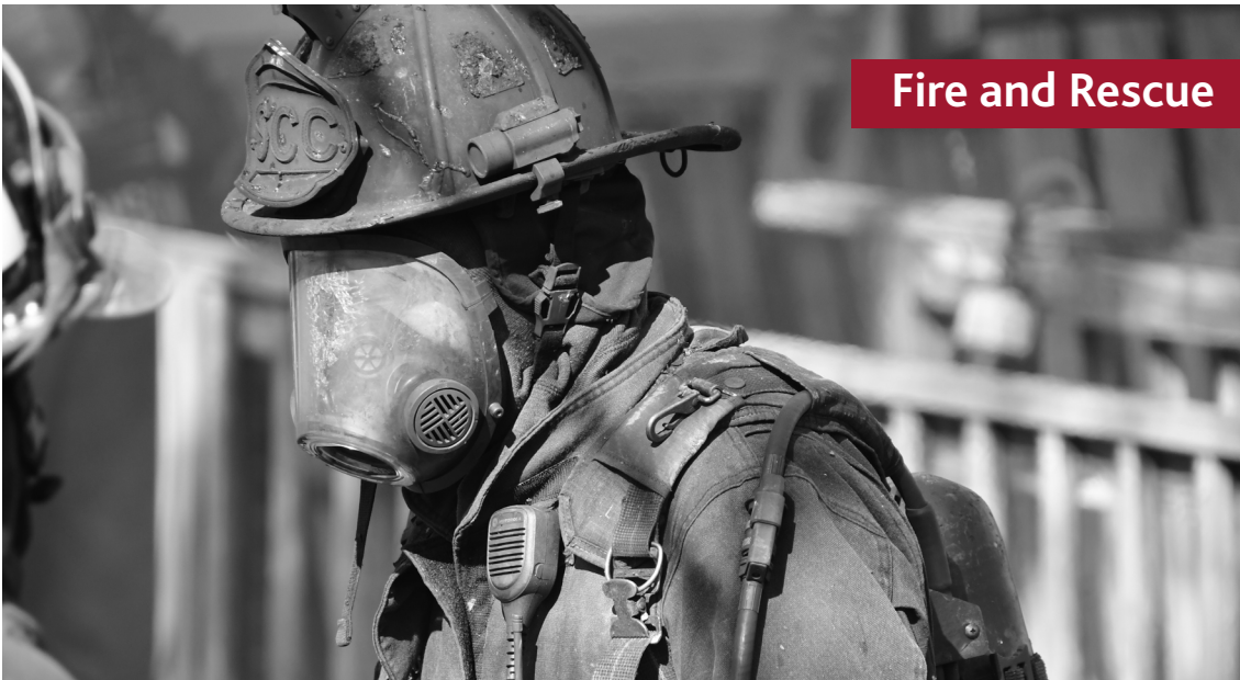
Fire and Rescue