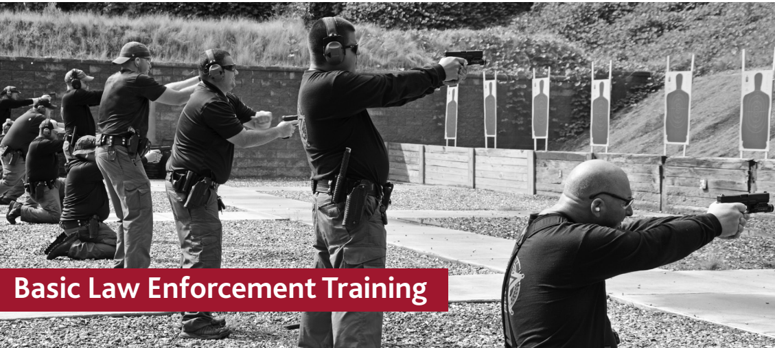
Basic Law Enforcement Training