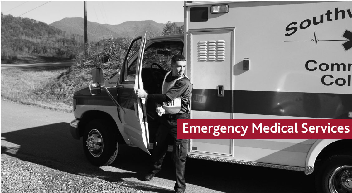
Emergency Medical Services